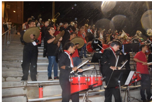
The LHS Marching Band at the 2016 Homecoming game.

If the band holds a special support this cause. Donations appreciated. Contact the Foundation on the website, or just give.