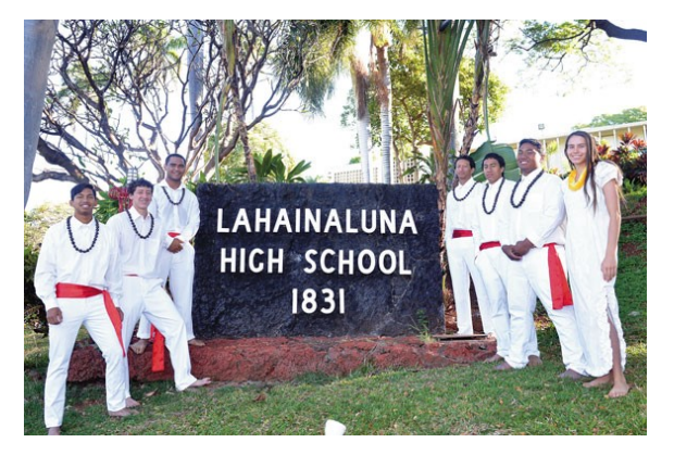
The 50th Anniversary of the Hawaiian Club was one of the Foundation's grant recipients.