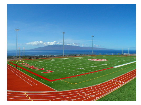
(Above) Sue D. Cooley Stadium-2010