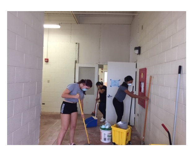
HOSA student volunteers help with setting up the new health center.