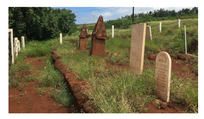
The Lahainaluna Cemetery prior to the Foundation's renovation project.

Bird of Paradise Restaurant Hawaii Prince Golf Club Hokuala Golf Ka'anapali Golf Kapalua Golf Lahaina News Maui Jim Sunglasses Poipu Bay Golf Ritz-Carlton, Kapalua Samar Sentry Tournament of Champions Tony Honda Trilogy Excursions UFO Wailea Golf Russell Yamane & Associates CPAs, Inc.