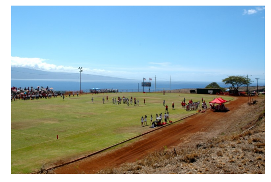
(Above) Football game in "Da Imu" - 2008