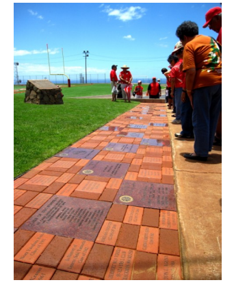
The 1st paver area. The pavers will now be located in front of the football statue, behind the arrival building.