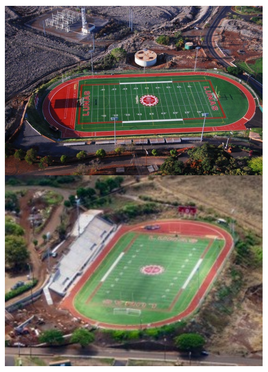
Aerial view of the stadium as the bleachers go

In April of 2010, Hellas Construction Company started on Phase 1 of the stadium project; the installation of an artificial-turf field, 4-lane allweather track, scoreboard, lights and makai fencing. Ninety days later Lahainaluna had a state-of-the art field.