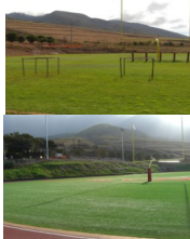
North endzone 2008